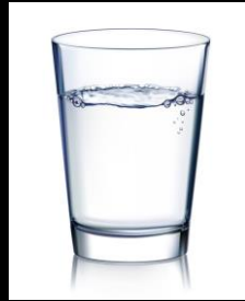
Glass of water