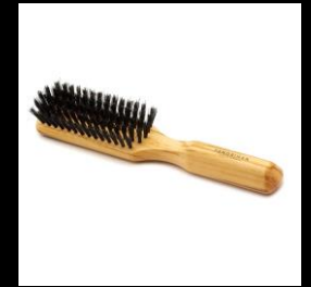
Hairbrush and makeup

Props will increase the production value by adding more interesting objects to look at in the scene. It makes the audience look around the scene.